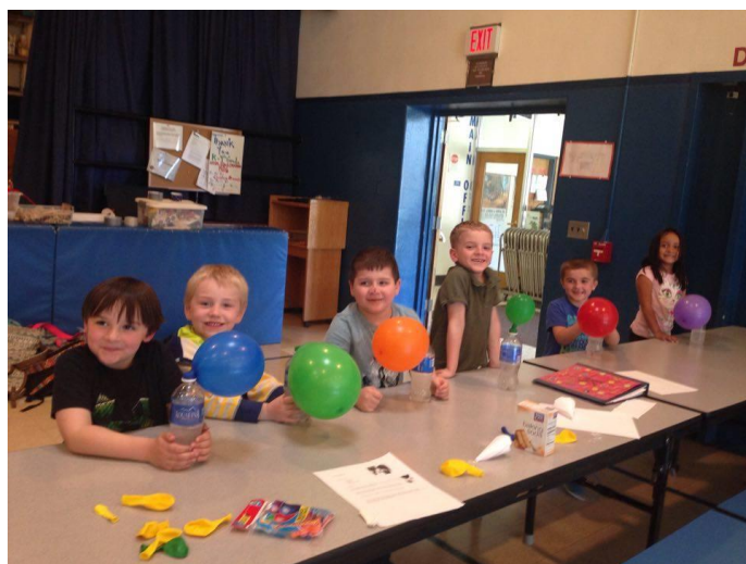
Children discover they can blow up a balloon using a water bottle, vinegar and baking soda